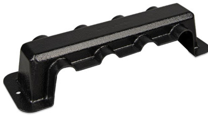
Cover for busbar 250 A with 4 terminals