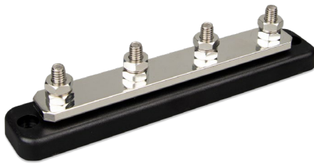
Busbar 250 A with 4 terminals without cover